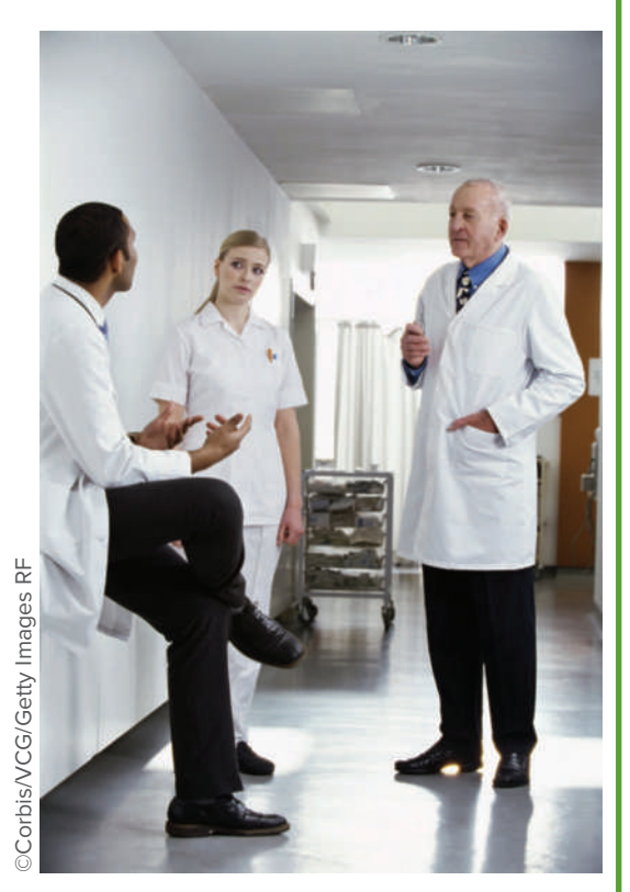
Who is the most passive figure in this group?